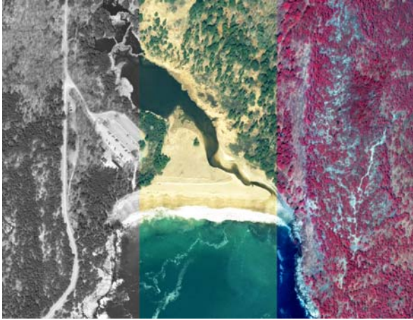
Black & white, true color, and Color Infrared imagery simultaneously captured with a digital camera for the Town of Bar Harbor, ME in April 2008. Sand Beach, Acadia National Park, ME.

For detailed information on the benefits of becoming a Sustaining Member, please see the back of this pamphlet or visit our website.