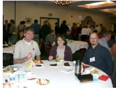
MMA Technology Conference, March 2009.