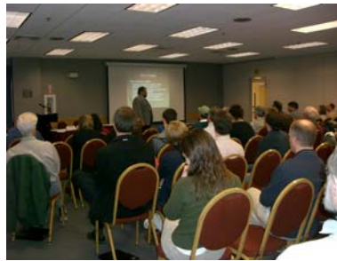
MMA Technology Conference, March 2009.

Discussion forums are held throughout the state, bringing knowledge to all of the Maine GIS Community.