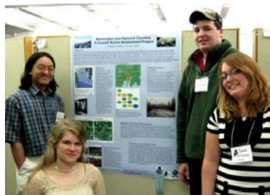
Undergraduate Poster Competition, April 2009.