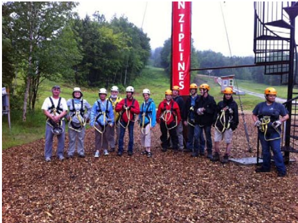
Summer School Zip Line Adventure Sunday River, June 2011

Members enjoy conferences, information sharing and social networking.